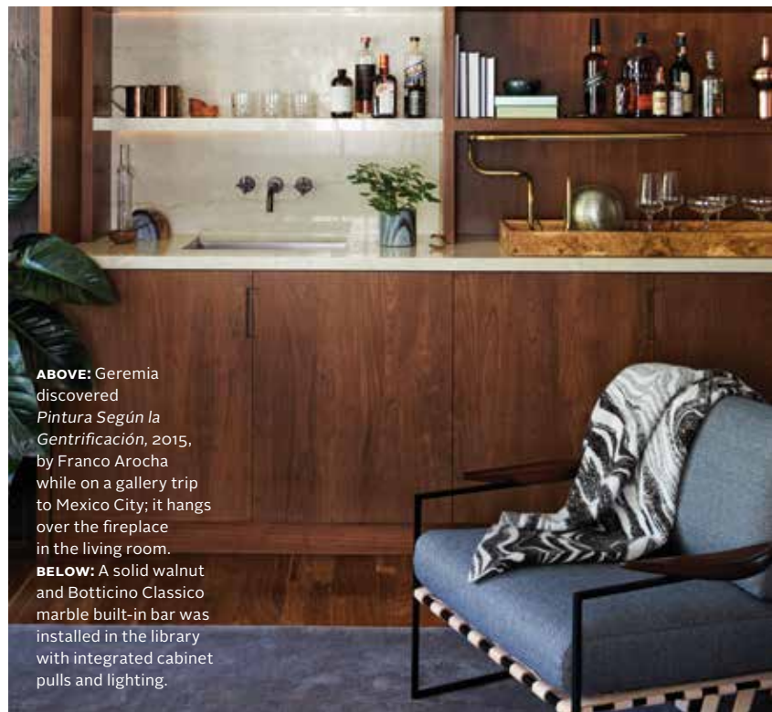
ABOVE: Geremia discovered Pintura Según la Gentrificación , 2015, by Franco Arocha while on a gallery trip to Mexico City; it hangs over the fireplace in the living room. BELOW: A solid walnut and Botticino Classico marble built-in bar was installed in the library with integrated cabinet pulls and lighting.

Not too far away, the designer installed a custom bar constructed with Botticino Classico marble and the same solid walnut as the dining room screen, which continues the modern, masculine tone. Continuing to the kitchen, Fireclay tiles in Frost were installed on the backsplash to illuminate the existing cabinetry, while a Trapeze